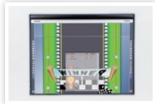
Games selection to show results and student performance